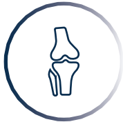
Bone & Joint Pain