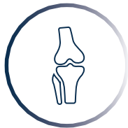
Bone & Joint Pain