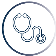
General Medical Conditions