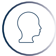
Ear, Nose & Throat Conditions