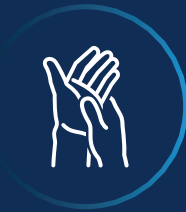
Hand & Wrist