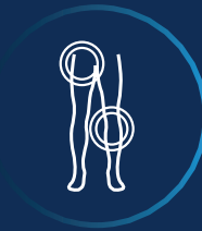
Hip & Knee