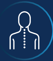
Spinal & Back