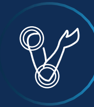
Shoulder & Elbow