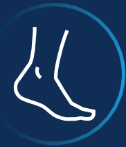
Foot & Ankle

Get back to moving without pain through fast and convenient access to treatment