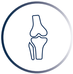
Bone & Joint Pain