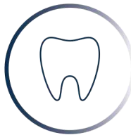
Oral Surgery *Private service only