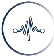
Cardiology *Private service only