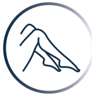
Vascular *Private service only