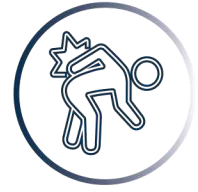
Back & Spinal